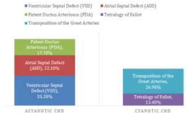
Figure No. 3: Percent stacked chart of echo findings between cyanotic and acyanotic heart diseases

By running Chi-square test a significant correlation was seen between certain heart abnormalities and specific clinical presentations. Cyanosis was significantly linked to transposition of the great arteries and tetralogy of Fallot ( p < 0.05 ). (Table 4) On the other hand, newborns who presented with poor eating and failure to develop were more likely to have isolated ventricular septal abnormalities ( p < 0.05 ).