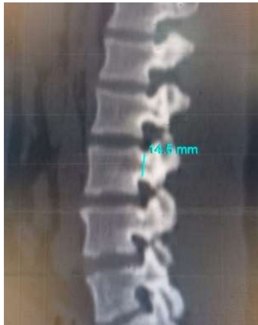
Figure No. 2: Pedicle Height (PH) Measurement in millimeters (mm)

Pedicle Height: It was measured in sagittal plane. Vertical distance between superior and inferior borders of the pedicle at its midpoint was measured in millimeters (figure-2).