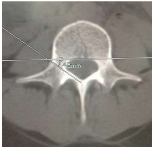
Figure No. 3: Pedicle Length (PL) Measurement in millimeters (mm)

Pedicle Length: A horizontal line was drawn touching the posterior border of the vertebral body. Another line was drawn along the longitudinal axis of lamina; the length of pedicle was calculated by drawing a third line that passes through the axis of the pedicle and touches the above-mentioned lines (figure-3).