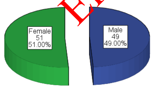
Figure No. 1: Gender distribution of patients

Among underweight, stroke occurred in 11 (28.9%) however, in normal BMI patients, stroke occurred in 17 (27.4%). The patients who had duration of mitral stenosis 1-2 years, stroke occurred in 9 (26.5%) while in patients having mitral stenosis for 3-5 years, stroke occurred in 19 (28.8%) cases (Table 2).